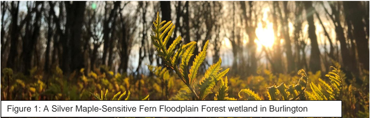
Figure 1: A Silver Maple-Sensitive Fern Floodplain Forest wetland in Burlington