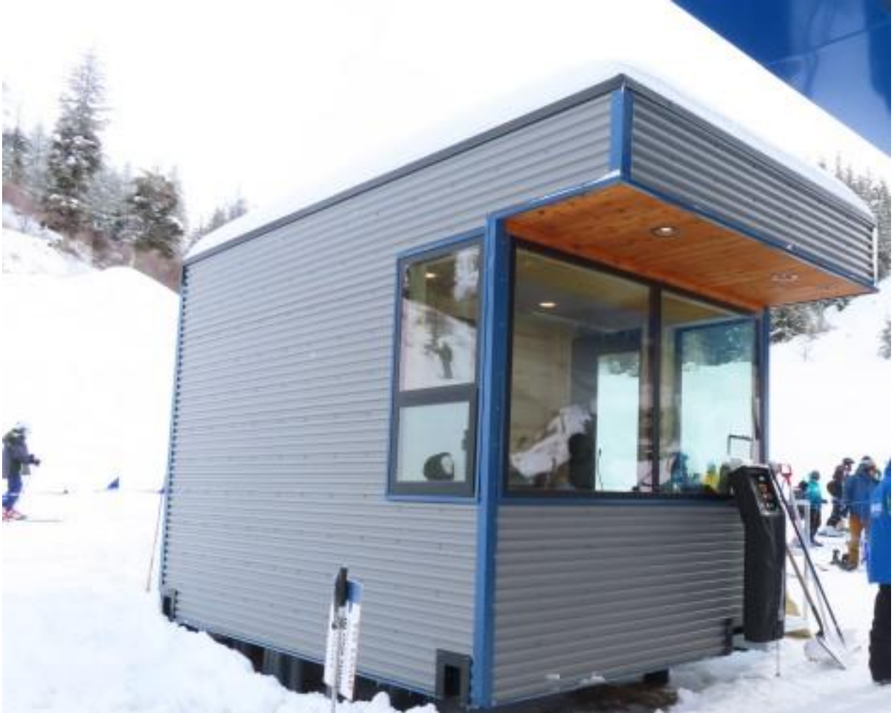
Mt Snow lift replacement huts will have a similar color and style.